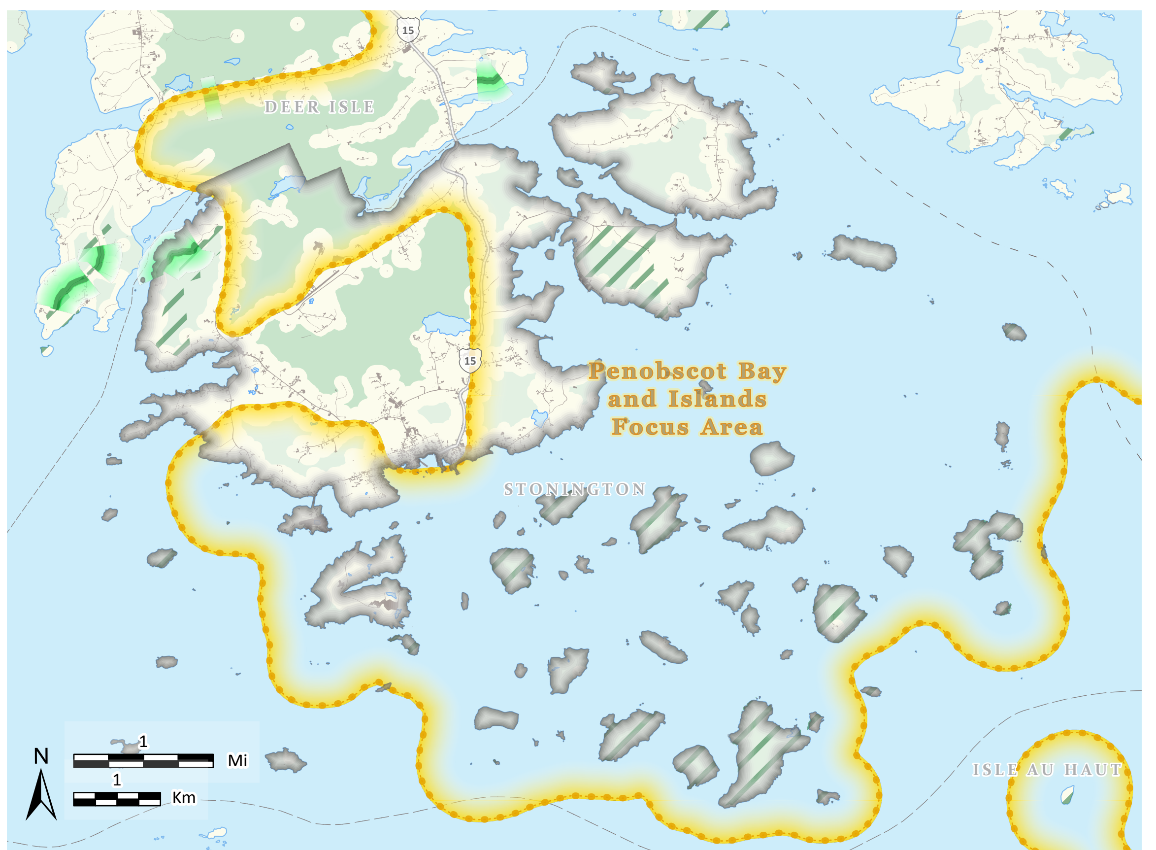
This map is nonregulatory and is intended for planning purposes only